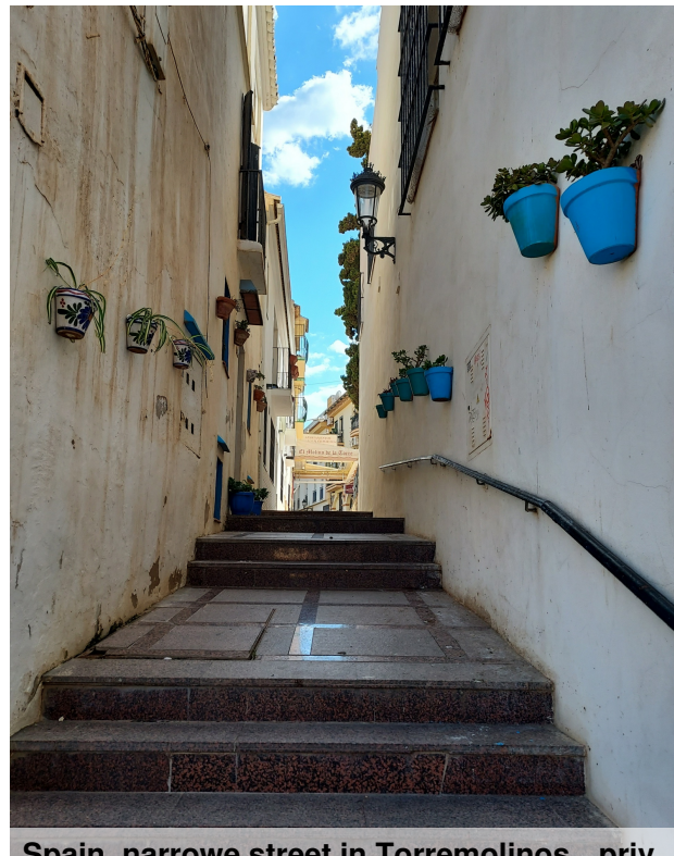
Spain, narrowe street in Torremolinos priv.

While working in the restaurant we dealt with tableware. We collected dirty dishes from guests on service trolleys, tidied up the tables and arranged napkins and cutlery. After breakfast was over we only had to clean the restaurant room and prepare it for the next meal. In the housekeeping department, we took care of the tidiness of common parts in the hotel: corridors, hotel lobby, terrace, games room and bar which was located outside, next to the swimming pool. As a result of constant contact with employees, we got everyday contact with the Spanish language and learned words related to each department. It was the most effective learning because we had a lively contact with the language.